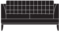
Level I and GREENGUARD Certified

Fully upholstered. Quilted seat and back cushion. Maple solids. Available in all finishes. When specifying light finishes 836, 837, 840, 850 and 870 the natural characteristics of the wood will be visible. See terms and conditions. Standard with welt. *All COM/COL fabrics must be preapproved by Bernhardt Design prior to application. Approved for GSA. Contract GS-28F-7040G.