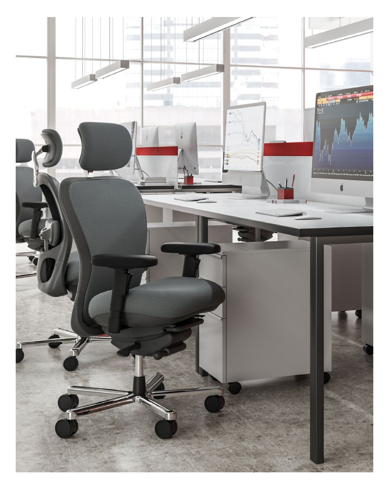
CXO 6200hd Stretch Collection (Slate)