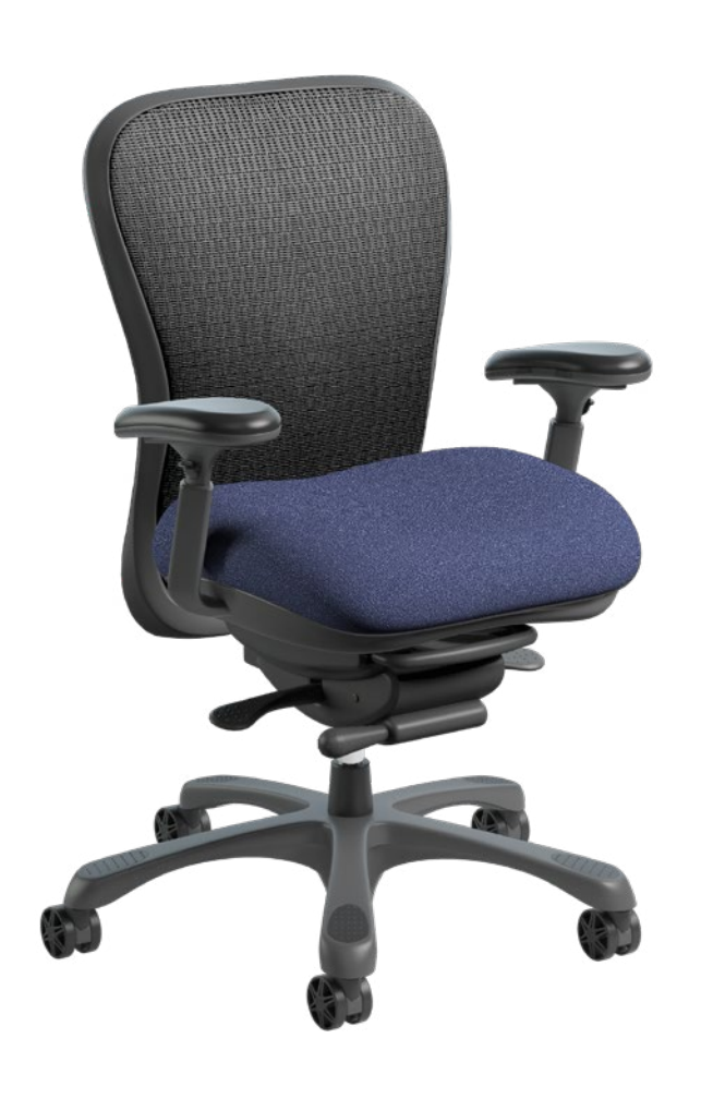
6200 STRETCH COLLECTION MERIDIAN | MER002 | Monarch Blue

The CXO™ can be upholstered with our high-quality textiles, vinyls, or leathers. Customize your chair with our wide range of colors and grades on My Chair Maker: nightingalechairs.com/my-chair-maker