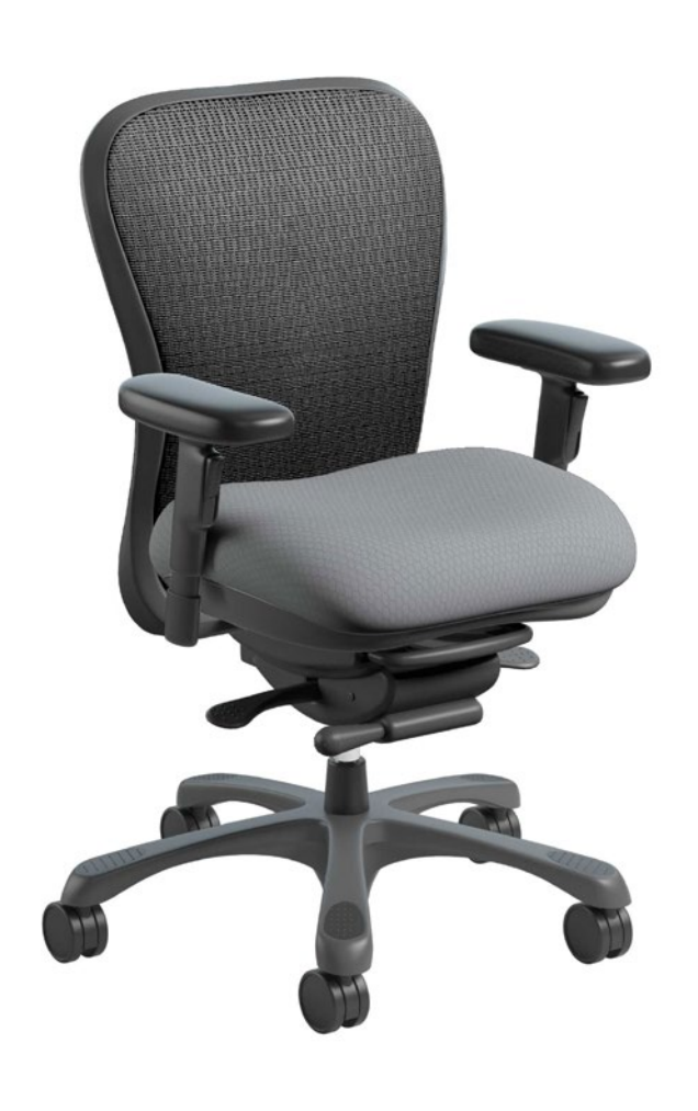
6200-TI STRETCH COLLECTION BEEHAVE | BEE10 | Slate