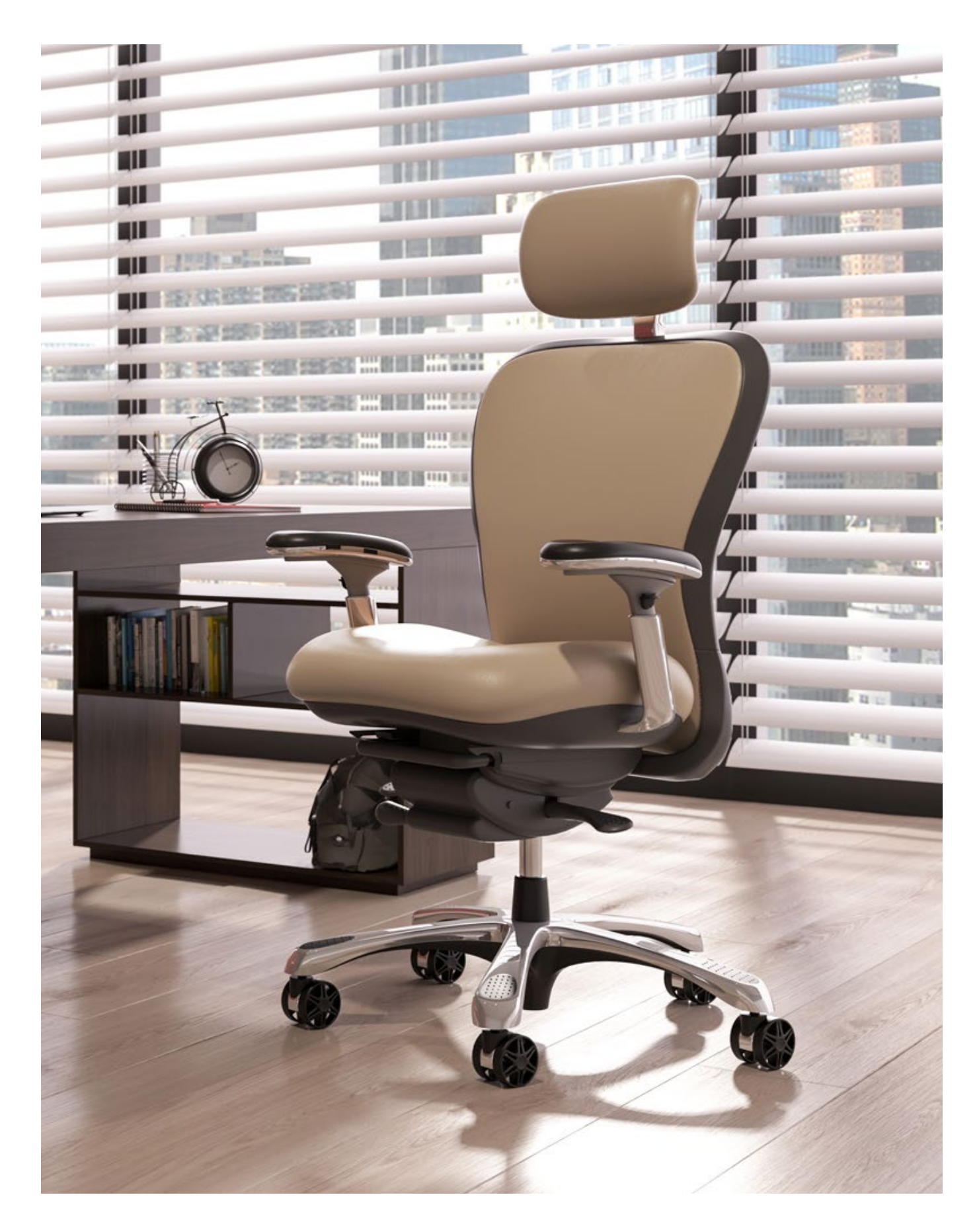
CXO L6200 Princess Leather (Sand)