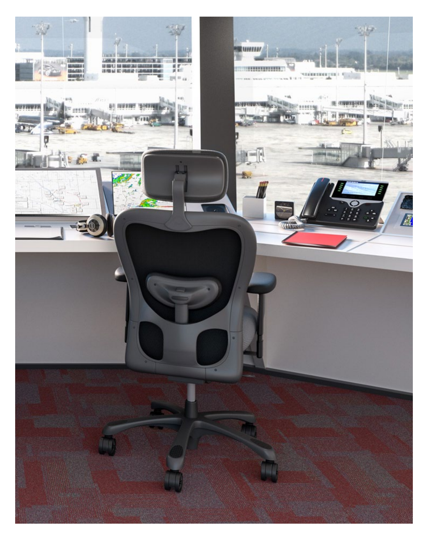
CXO 6200ti Stretch Collection (Sand)