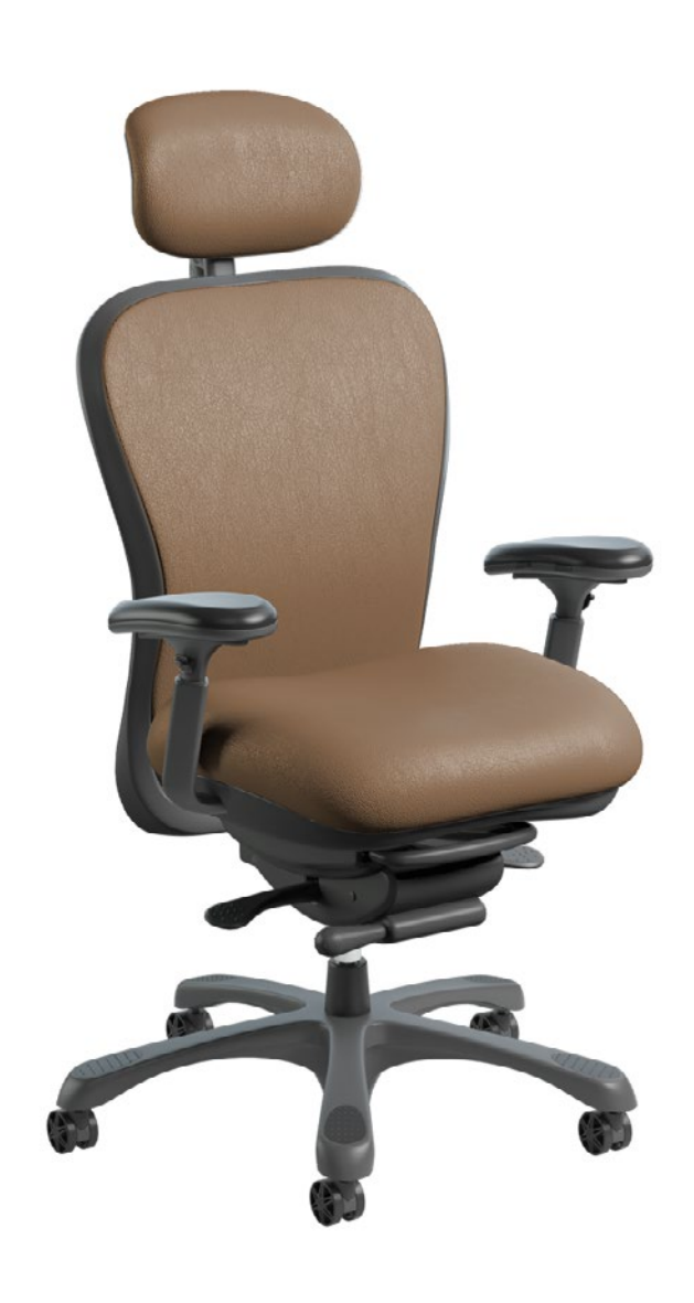
LEATHER COLLECTION PRINCESS | 185 | Almond