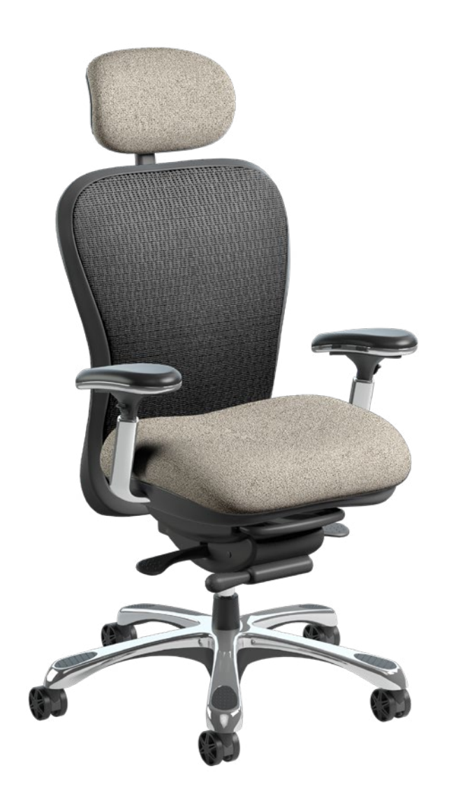
6200D-CH STRETCH COLLECTION MERIDIAN | MER007 | Cappuccino