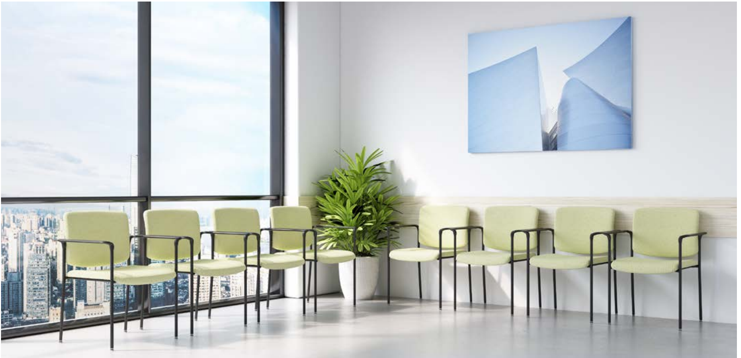
Cricket II 502