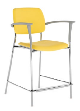
W524AUU with grip assist arms