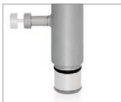
3" height adjustable legs with preset locking pin