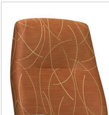
Concealed Schukra adjustable headrest support for easy adjustment and individual comfort (on select models)