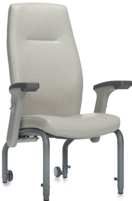
High back patient chair with Schukra lumbar and headrest