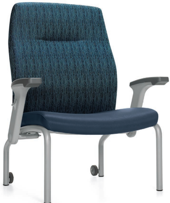
Bariatric high back patient chair

Nourish™ was developed in consultation with leading healthcare professionals. It is an innovative, state-of-the-art patient chair that offers unique features to accommodate a variety of body types, sizes and mobility issues. To facilitate safe patient transfer, each arm can easily be raised allowing horizontal movement in and out of the chair.