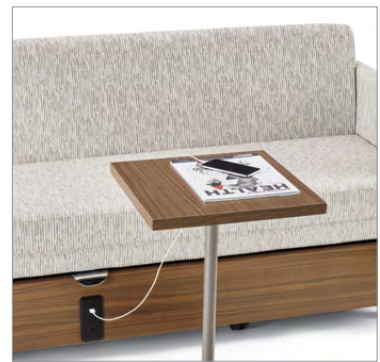
Optional power and USB outlet available on front pull-out panel