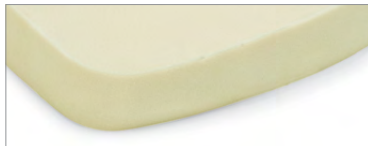
High density Ultracell foam seat for enhanced comfort