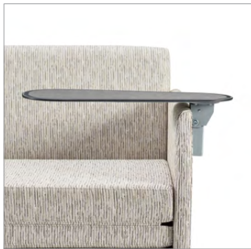
Flip and rotate tablet arm offers convenient surface for users