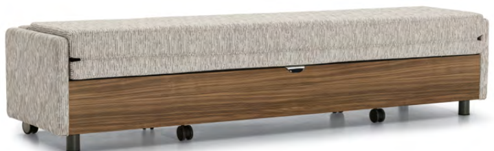
Dreme sleeper bench, low profile design, positions well below room windows to welcome natural light. Optional laminate, pull-out front panel shown.