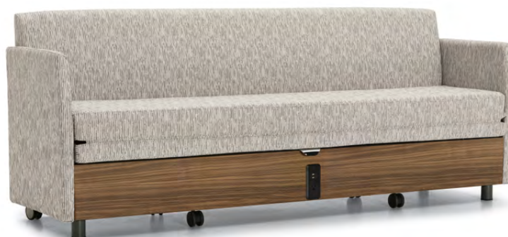
Dreme sleeper sofa with upholstered back and arms. Optional laminate, pull-out front panel shown. Optional power and USB outlet shown.

Seating shown with Walnut Heights panel and Toast legs.