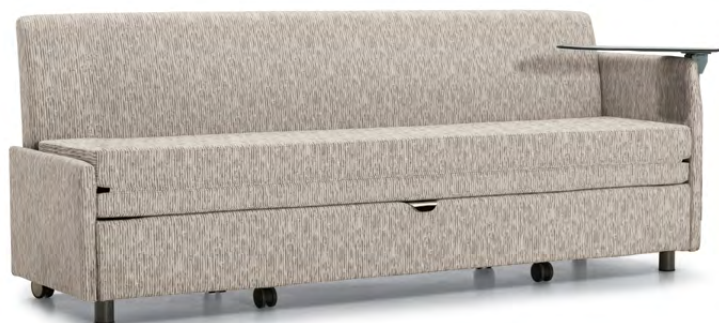
Dreme sleeper sofa with upholstered back, single left arm and tablet (single arm without tablet also available). Flip and rotate tablet is optional on sofas with arms. Upholstered pull-out front panel shown.