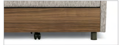
The pull-out front panel is available upholstered or in laminate