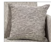
Optional throw pillow