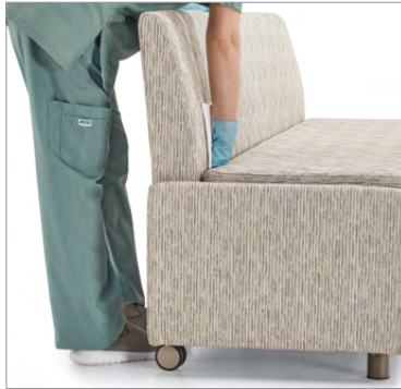
Clean out space supports housekeeping and infection control practices