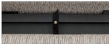
Seat cushion is field replaceable by detaching connection straps