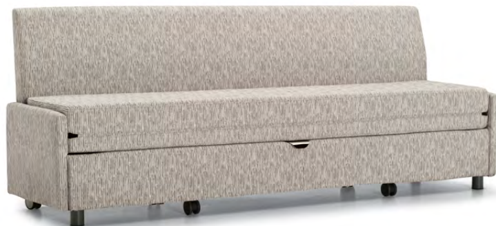
Dreme sleeper armless sofa with upholstered back and pull-out front panel.