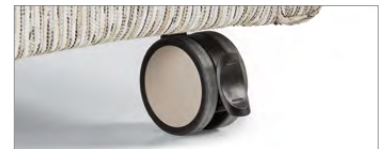
Optional locking front casters provide greater mobility