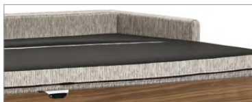
Interior area of the sleep surface cushion is finished in a moisture barrier, coated textile to support infection control practices