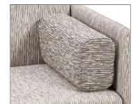
Optional bolster cushion