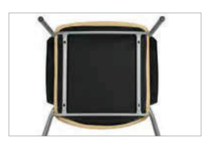
24" and 30" models come standard with vinyl upholstered underside aiding in infection control.