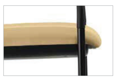
Ultracell BioPlush foam with waterfall seat, ensures maximum comfort (shown with seat shroud).