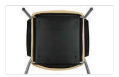
Underside seat shrouds (19.5" models only) help avoid impressions and damage when stacked.