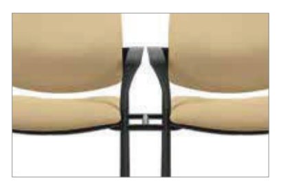
Optional steel ganging clamps easily attach multiple units together to create desired configurations.