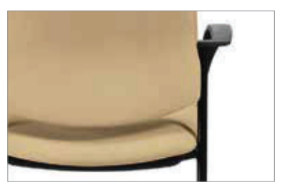
Two piece back allows support brackets to be