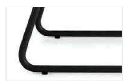
Rugged steel frame.