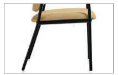
Angled back legs create a wall saver frame. Sled base is also wall saver.