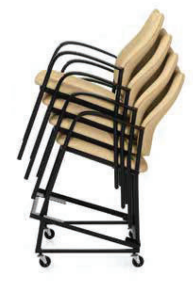
Dolly (2125WS) allows 19.5" seat width models to stack 8 high.