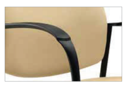
Wide, fully extended arms, available in Black only.