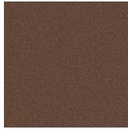
108 FT oxide fine textured