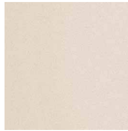
109 FT champagne fine textured