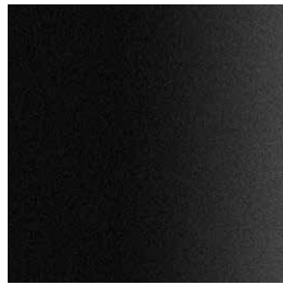
101 FT black fine textured